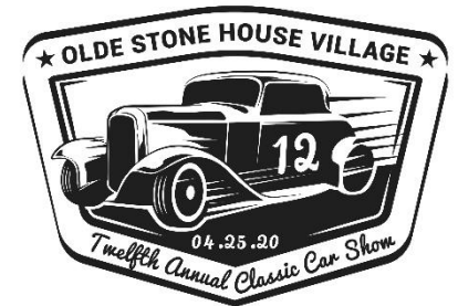
This Years Shirt Front

This years Dash Plaque we are donating to the 1 st 100 cars